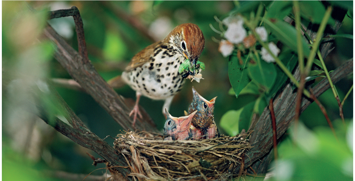
Wood Thrushes raise their young in the forests of the eastern United States. They migrate between the U.S. and Central America, flying nonstop across the Gulf of Mexico.

Millions of raptors migrate to Central and South America in the fall. This includes as many as 845,000 Swainson's Hawks .