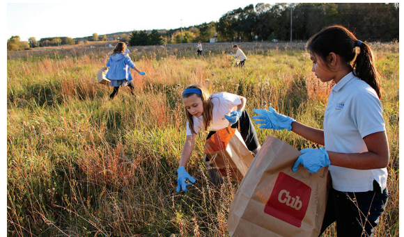
These young people are helping to protect natural habitat for birds that feed, nest, and rest here.

One of the biggest problems for any migrating bird is the loss of habitat. Birds need healthy habitats everywhere they spend time throughout the year. That includes the places they nest and raise their young, the places they spend the winter, and the places they stop along their migratory journeys to rest and feed. They need wild unbuilt places like woods, beaches, grasslands, and wetlands. When natural areas are replaced by roads, homes, shopping centers, farms, and other human-made structures, there is less of the healthy habitat birds need throughout the year. A healthy habitat is also a place where there are plenty of native plants—the kinds of plants that grow naturally in a particular area. Those plants provide more nutritious