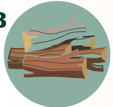
Firewood – larger, dry pieces of wood up to about 10" around.