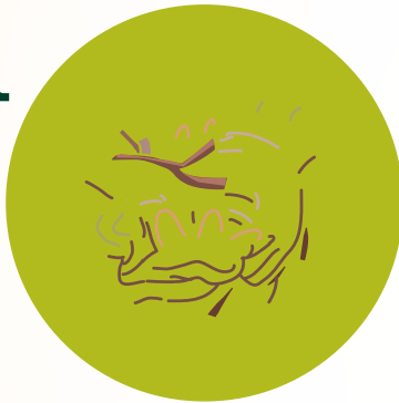
Tinder – small twigs, dry leaves or grass, dry needles.