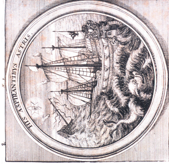
Storm, shipwreck, and sea monster.

In September 2003, NOAA's Ocean Exploration Program visited a newly discovered shipwreck in the Stellwagen Bank National Marine Sanctuary on the coast of Massachusetts. Underwater archaeologists studied the wreck to learn more about what happened to cause the ship to sink. Now it's your turn to be a Wreck Detective!